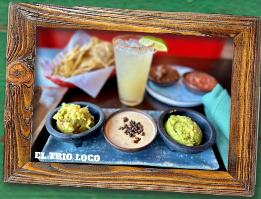
EL TRIO LOCO

Hussong's Cantina is the oldest bar in Baja California Mexico, liquor license #002 issued in 1892 (#001 is out of business)