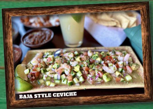
BAJA STYLE CEVICHE