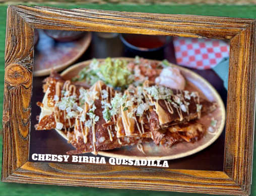
CHEESY BIRRIA QUESADILLA

Mexican Cheese Blend & Cheddar Cheese, Crispy Flour Tortilla, BBQ Chicken, Cilantro, Onion, Chipotle BBQ Sauce, Chipotle Aioli, Pickled Red Onion