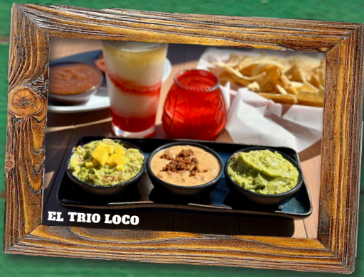
EL TRIO LOCO

Hussong's Cantina is the oldest bar in Baja California Mexico, liquor license #002 issued in 1892 (#001 is out of business)