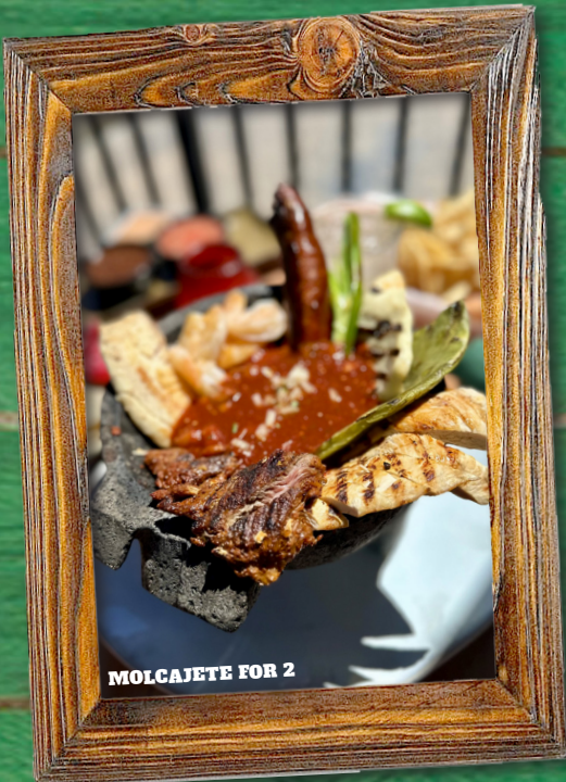
MOLCAJETE FOR 2

Carne Asada, Chicken, Shrimp, Nopal, Panela Cheese, Red Salsa, Beans, Corn Tortillas, Pickled Onion, Limes. Served with Beans and Rice