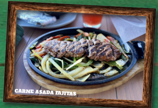
CARNE ASADA FAJITAS