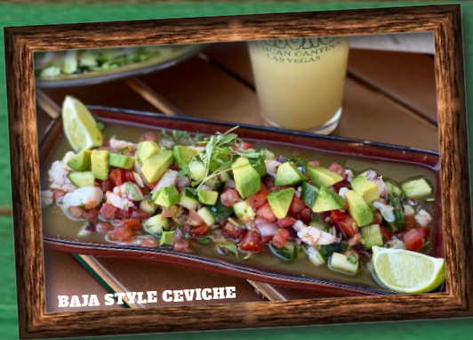
BAJA STYLE CEVICHE